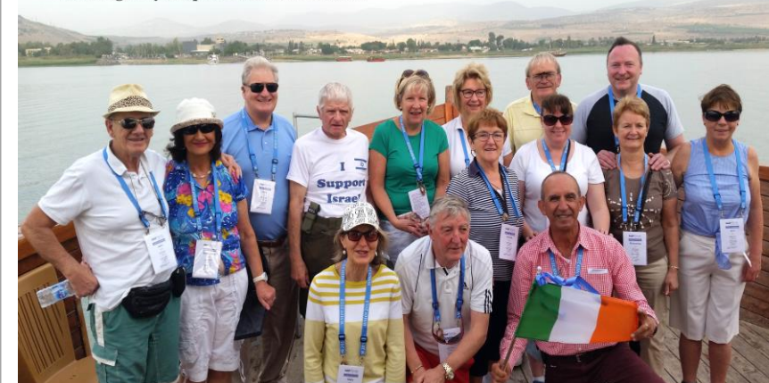
Greetings from the Holy Land - Day 2 of the pilgrimage Morning Prayer upon The Sea of Galilee

Coffee Morning: All are welcome to St. Saviours Church Hall from 10 -12 on Thursday 8th November to a coffee morning in aid of local person travelling to Sri Lanka to volunteer in an orphanage in January 2019.